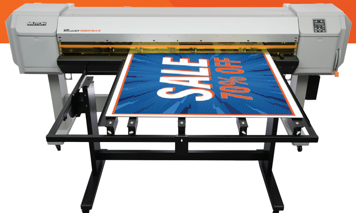
ValueJet 1638UH Mark II