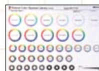
Roland Color System Library

Every VersaCAMM comes with VersaWorks, our own RIP software for professional print quality. VersaWorks features the Roland Color System to accurately reproduce the spot colors you select from Roland Color charts and swatch books. Variable Data Printing makes it easy to create a series of individualized prints based on one template, with each print featuring its own photos, messages, numbers and names. In addition, VersaWorks estimates the ink usage and print time for each graphic so you can accurately monitor your time and costs. You can also update your software automatically through the Internet.