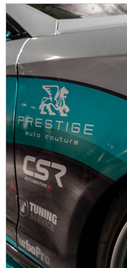
Prints and wraps by wrapmyride.nu