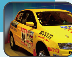
▶ PVC Vinyl / Window Tint Film/Paint Protection Film