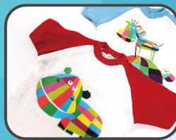
▶ Heat Transfer Film