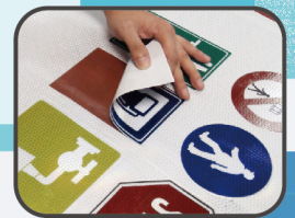
▶ Reflective Film / Sandblast Film